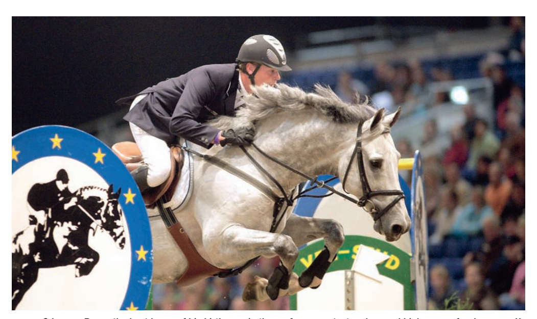
Odermus R was the best horse of his birth year in the performance test and earned high scores for dressage. He became an international show jumper and is now standing at stud at Staatsstoeterij in Flyinge.