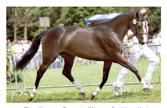
The elite mare Zersante (Mermus R x I Love You) scored in 82.5 points in the 2008 IBOP in Helden, ranking her among the better mares of the past year.