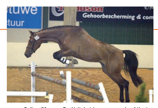
Selien (Mermus R x Voltaire) is one example of the top selection horses that Odermus R and Mermus R have produced. She finished Reserve Champion in freejumping at the National Mare Keuring.