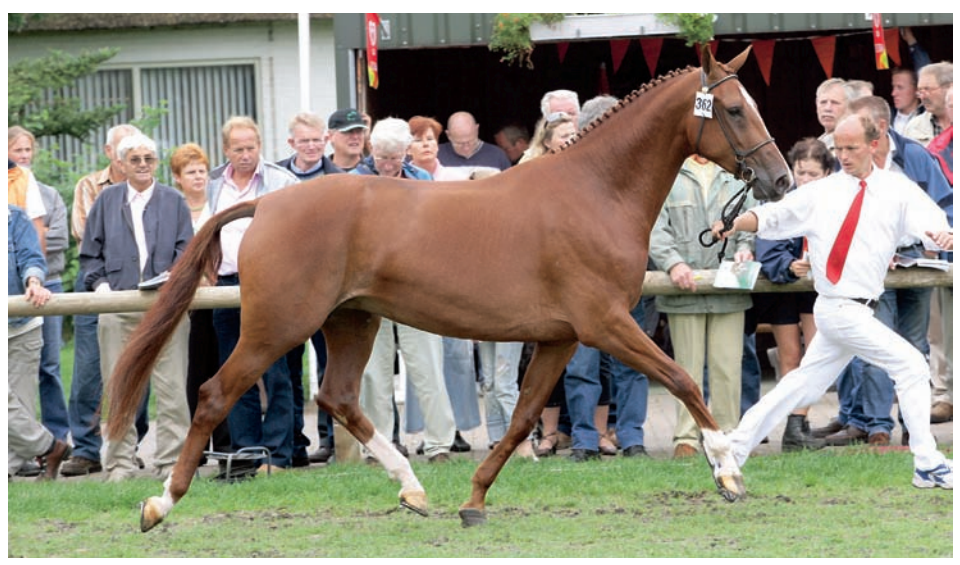
Winning Friesland Champion and finishing in third place at the National Mare Championship for keur and elite mares are among Vribalia SHB's (Odermus R x Burggraaf) achievements, who subsequently excelled in the young horse classes in Roggel. She is currently a Z-level show jumper.