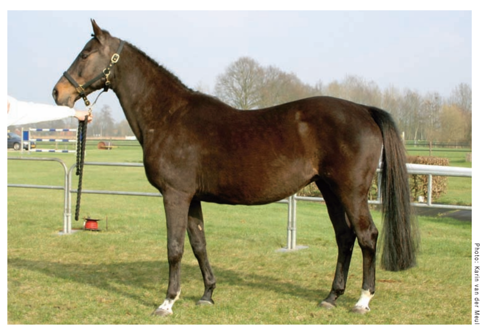
Dwermie pref prest (s.G.Ramiro Z), the dam of Mermus R and Odermus R, was a beautiful mare with lots of 'blood'. She passed away last year.

The half-brothers Odermus R and Mermus R have a great deal of Thoroughbred blood. For example, Odermus R's sire-line traces back to the Thoroughbred-cross Ramzes x who appears twice in the sire-line as the sire of Roman. Another Thorobred in the sire-line is Rantzau xx, who