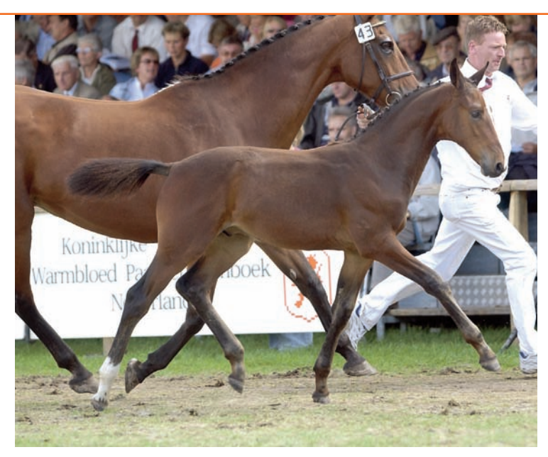
Zwinderman (Odermus R x Notaris) competed in the Champion Selection of the 2004 National Foal Selection.