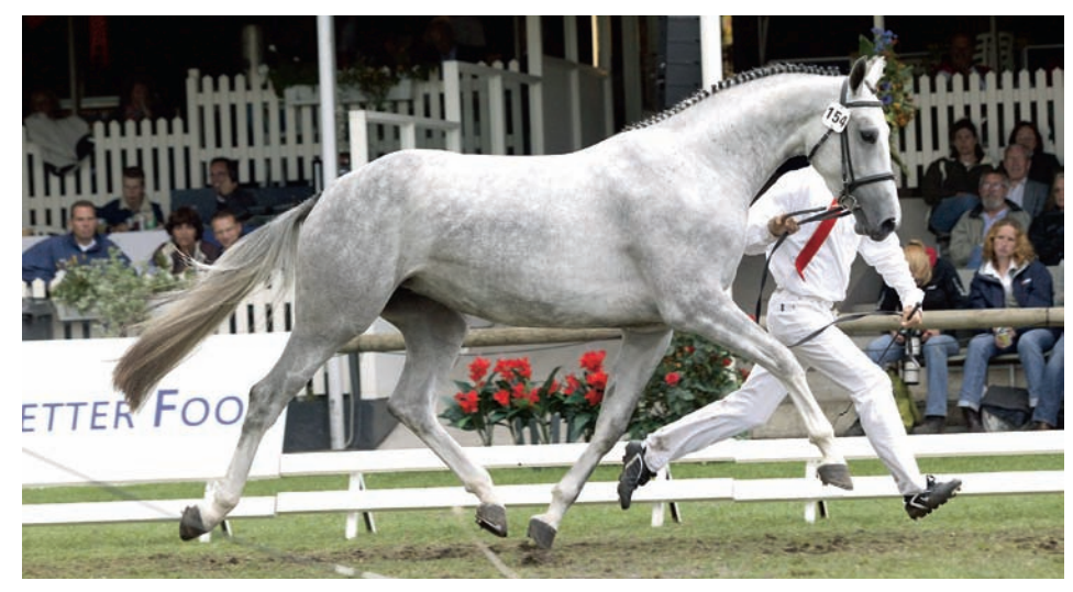
Zilverbea N (s.Odermus R) is both a beautiful horse and an excellent jumper as she proved by placing fifth in the National Mare Keuring and winning Reserve Champion in free-jumping.