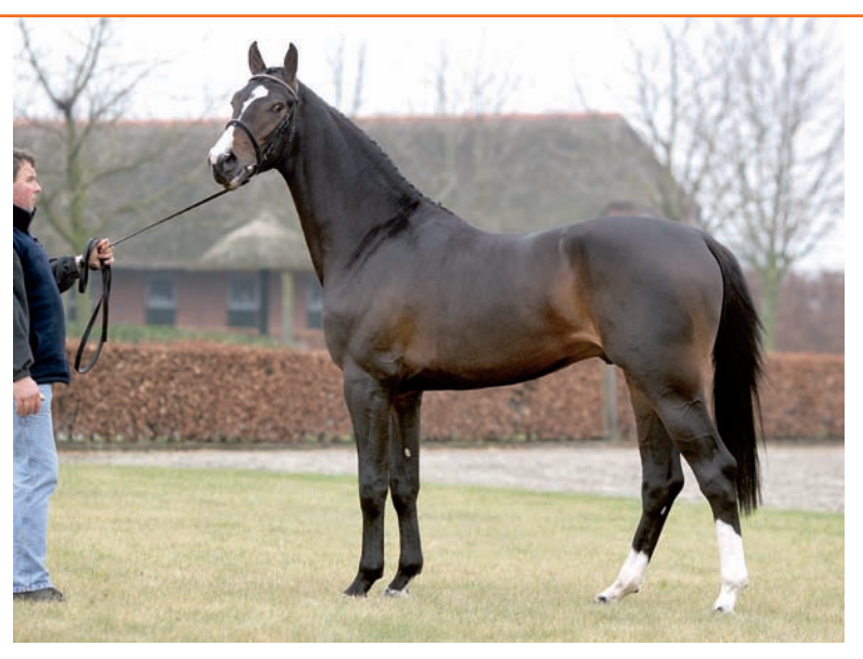
The selected stallion Wender (Contender out of Dwermie) is a half-brother of Odermus R and Mermus R and was also selected for the performance test. Wender finished fourth in the Champion Selection at the Stallion Show.