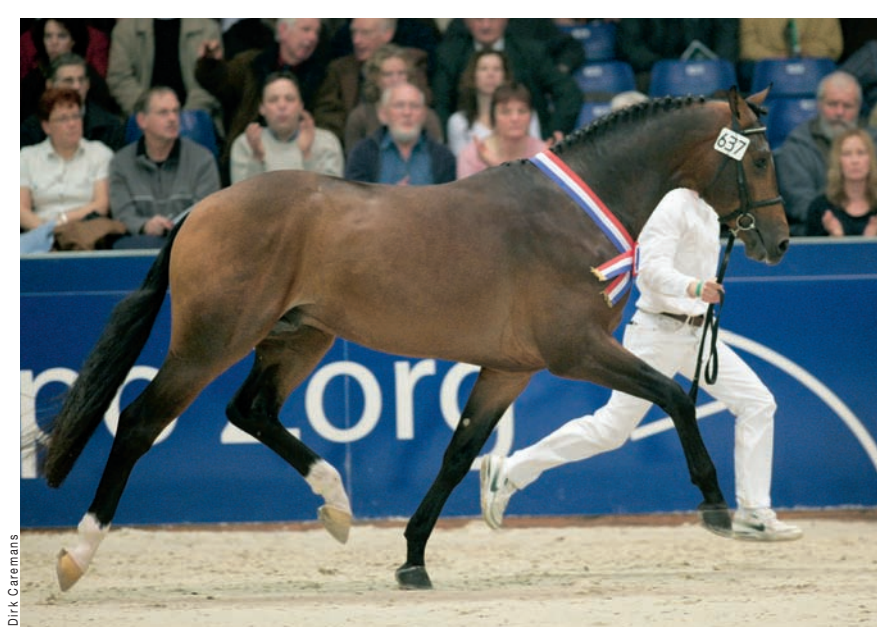
Rousseau's first year at stud produced the Stallion Show Champion, Wamberto, owned by Harmony Sporthorses in the USA.