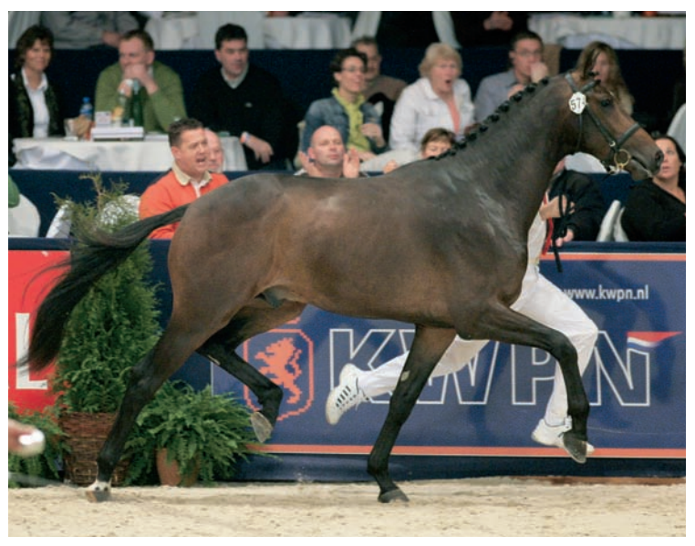
In his second and third years at stud, Rousseau sired two more Stallion Show Champions: Zagreb and Ampere. Zagreb (right), now known as Blue Hors Zack, was the top selling horse at the KWPN Select Sale that year with a bid of \in 430,000. Ampere (left) received KWPN approval with extremely high scores.